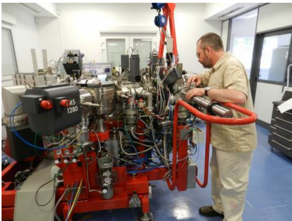
The front end (where solid samples, including polished rock sections are located) of the latest Cameca ims 1280-HR installed at CRPG.

For further details contact Professor Albert Galy