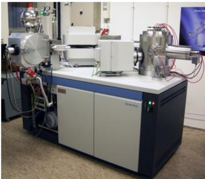
Triton plus at VU including 3 SEMs and 3 CDDs