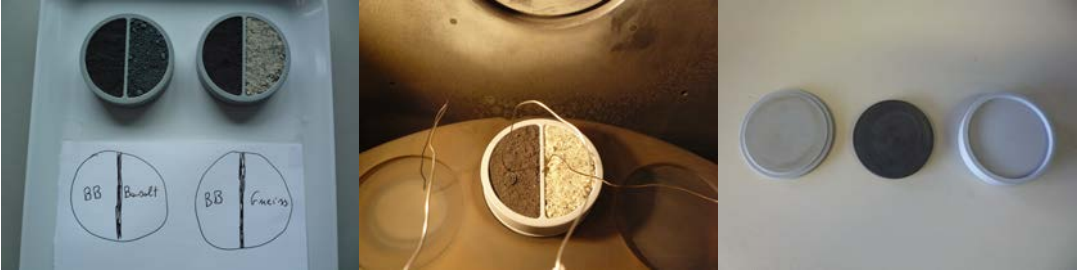
Figure 2 - Left: Set of ceramic enclosures containing two different samples. Centre: Ceramic enclosure for 2 samples in the emissivity chamber, prepared for measurements (see the temperature sensors on one sample and the

A modified version of the ceramic enclosure was developed to allow measurements of powder samples. We produced one design for single samples and one that could contain two separate samples (see Figure 2), for a better calibration of an imaging spectrometer working in the VIR/NIR spectral range.