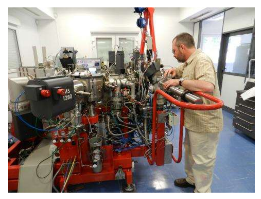
The front end (where solid samples, including polished rock sections are located) of the latest Cameca ims 1280-HR installed at CRPG.

For further details contact Professor Albert Galy