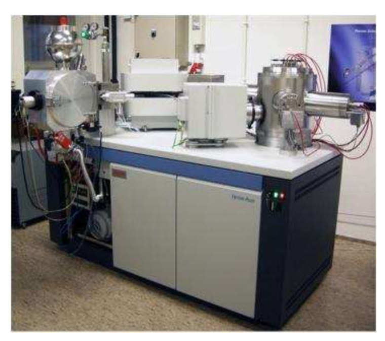
Triton plus at VU including 3 SEMs and 3 CDDs