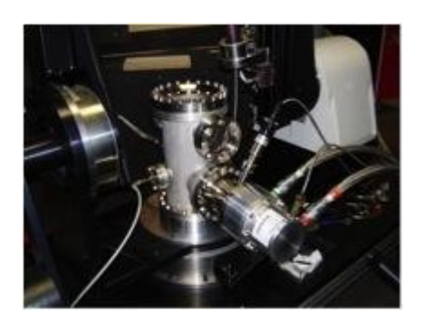
CarboN-IR environmental cell inside the goniometer

Spectro-Gonio Radiometer with its stabilized monochromatic source, the goniometer with illumination mirror, an open sample holder with sulfur powder and the detectors and the goniometer and detection electronics.