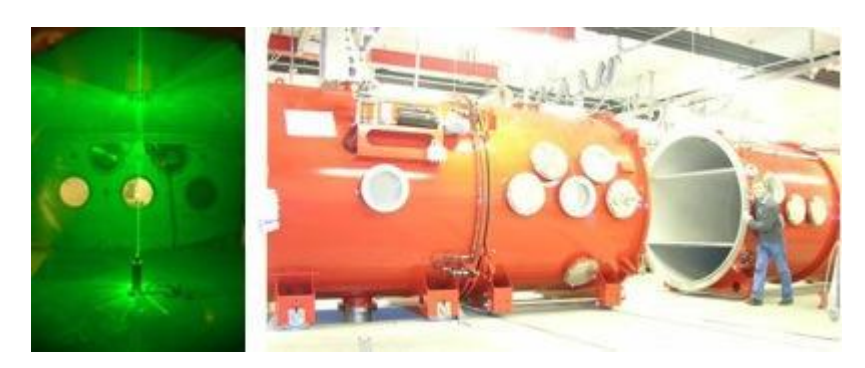
Green laser being used to monitor particle flow inside the chamber, b with Jon Merrison for scale

Planetary Environment Facilities at Aarhus University operates a unique experimental facility capable of re-creating the conditions found on other planets or extreme terrestrial environments. This facility is used for collaborative research by both the scientific and industrial communities, including space agencies (ESA, NASA). Specifically the facility is capable of recreating the key physical parameters such as temperature, pressure (composition), wind flow and importantly the suspension/transport of dust or sand particulates. It supports a broad range of research topics including Planetology, Volcanology, Meteorology and the study of Aerosols. Laser based optoelectronic instrumentation is used to quantify and monitor flow and particle suspension. For more information regarding access contact: Jon Merrison