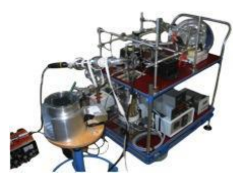
Serac cell and its thermodynamic system

A new spectro-gonio radiometer is under development to include Near-IR channel + calibration and optimized for the measurement, at low temperature, of bidirectional reflectance spectra, over the visible and near-IR (~ 0.3 to 5 \mu m), of very small dark and/or very fine grained samples (organics, meteorites, minerals) down to about 1 mm3 in volume.