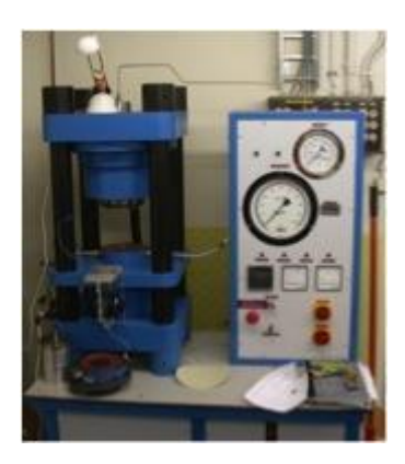
Piston cylinder press

For more information of the facility see http://www.falw.vu/~wvwest/lab.html, or contact Wim van Westrenen with specific questions about experimental techniques and access.